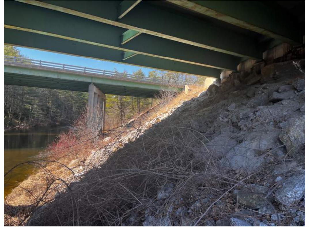
WARNER RIVER UNDER I-89 BRIDGES