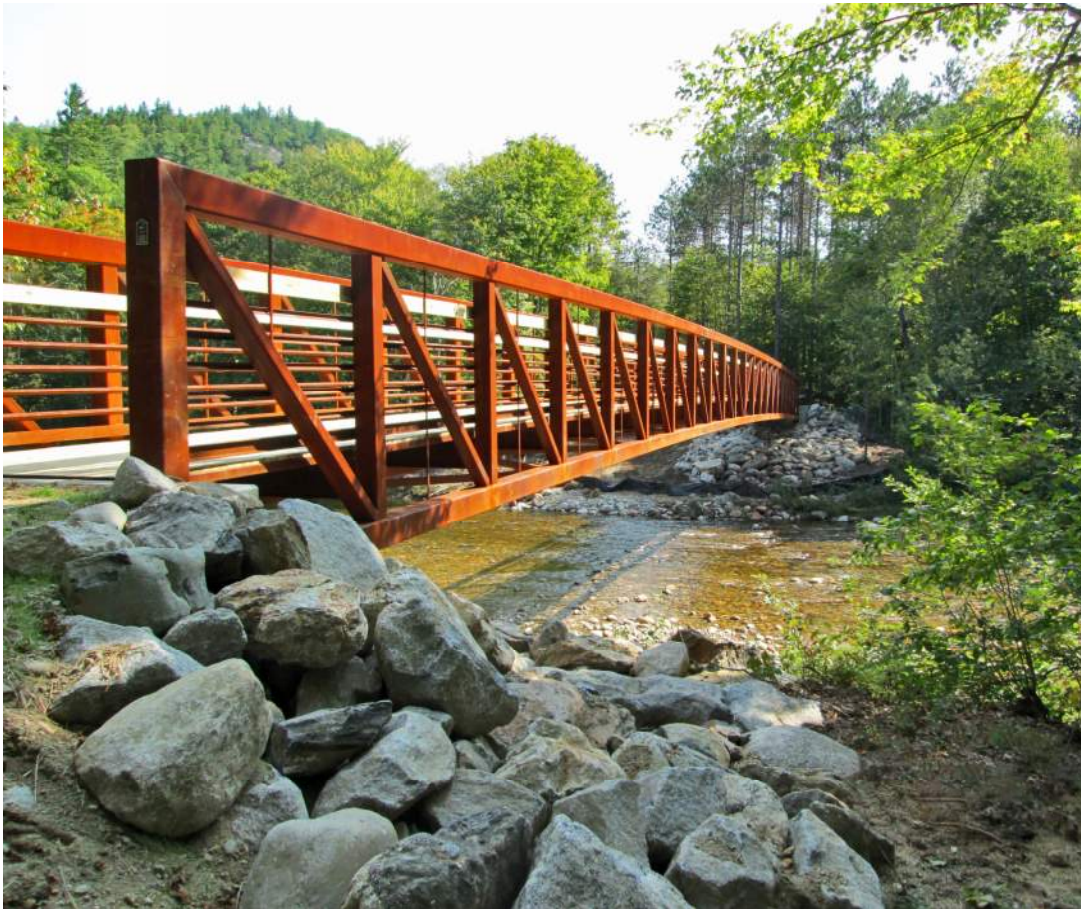
Hastings Trail Pedestrian Bridge